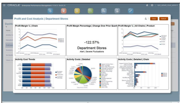
Configurable dashboards make it easy to quickly visualize profit & costs by key business dimensions

Profitability and Cost Management provides actionable insight into allocation-based business processes by seamlessly combining data from the general ledger and other financial systems with data from operational systems. The solution provides the transparency needed to support analysis within today's complex enterprises.