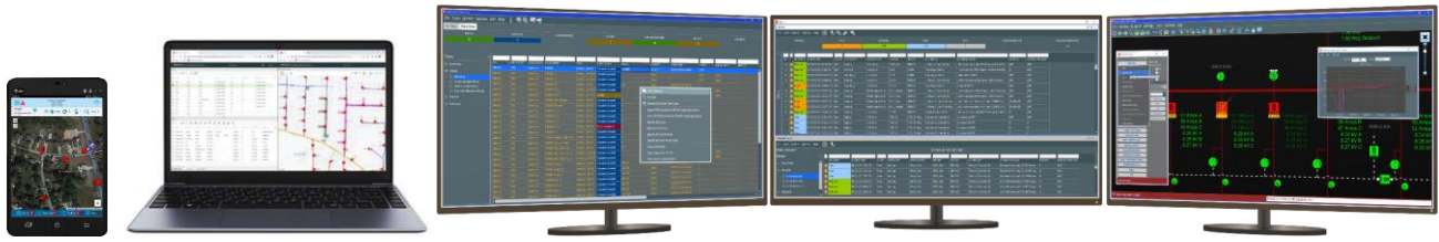
Figure 2. View, operate, dispatch, record and communicate across multiple device types and channels to accelerate outage management and restoration