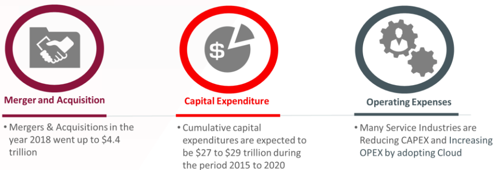
Figure 1: Steady growth in M&A, CAPEX and OPEX 1,2

These investments are also rapidly expanding the corporate lending market. For example, the cumulative size of all commercial and industrial loans in United States for the year 2018 was approximately 26.4 trillion USD 3 .