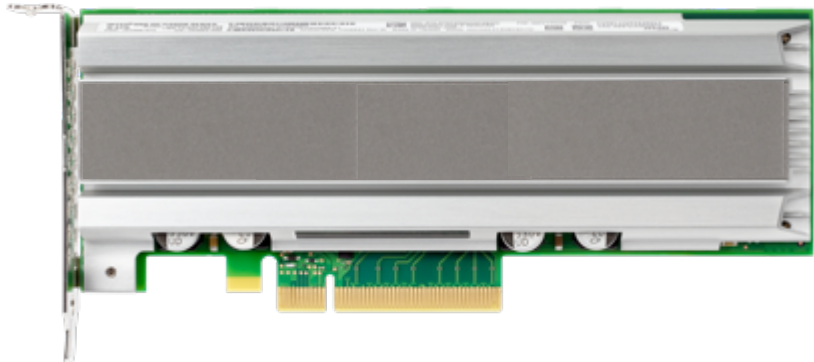
Fig 2: Flash Accelerator PCIe Card

- Milt Simonds Director, Enterprise Platform Delivery AmerisourceBergen Corporation