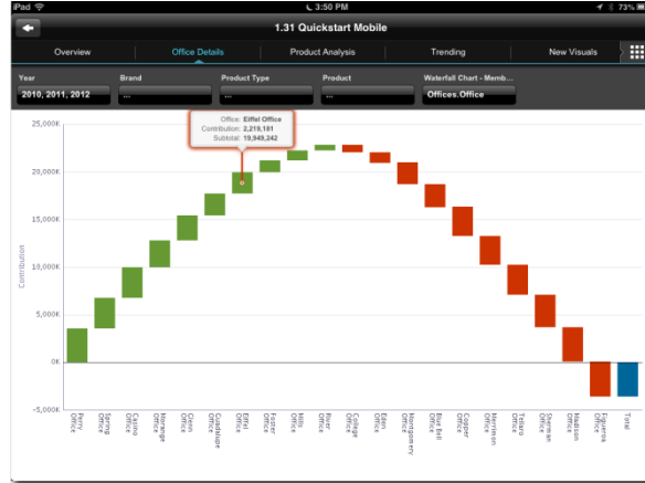
Figure 4. Double-tap to maximize a visualization, with full interactivity.