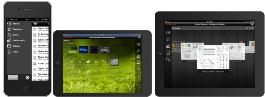
Figure 3. Redesigned Navigation and Home Page in the BI Mobile HD app for the Apple iPhone, iPad Mini, and iPad

View Maximize Mode. Users can double-tap all supported views like graphs, tables, trellis, maps, gauges, etc... to ‘maximize’ the view. The view renders using the full screen real-estate of the tablet, thus making it especially easier to view and work with dense data views. All supported behaviors like tap, tap-and-hold, and tap-and-swipe are available in this maximized mode.