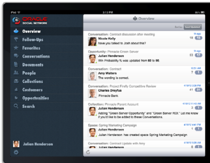
Figure 2: Oracle Social Network Mobile Application

Oracle Social Network can be accessed anywhere and anytime from a variety of interaction points including a Web browser, Outlook application, or Mobile and Tablet devices. Each client provides a rich experience through form factors specific to the devices they run on. Outlook integration bridges the social experience between Oracle Social Network participants and their email. Meanwhile, the native client on the Mobile devices provides a seamless interaction while on the road or as an alternative to the Web client.