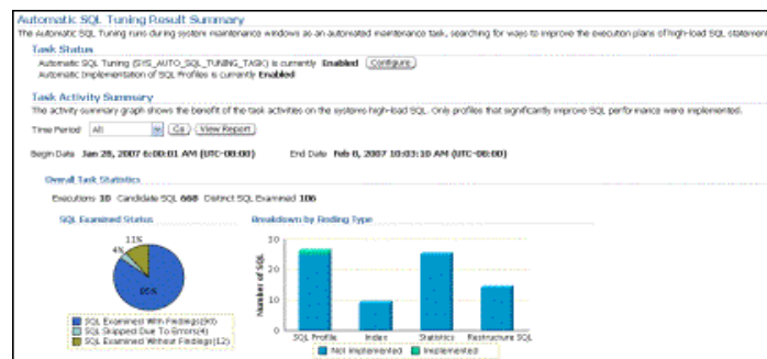
Figure 1: Automatic SQL Tuning Results Summary

The SQL Tuning Advisor also runs in automatic mode. In this mode, the advisor runs automatically during system maintenance windows as a maintenance task. During each run, the advisor selects high-load SQL queries in the system, and generates recommendations on how to tune them.