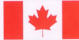
The Communications Security Establishment of the Government of Canada