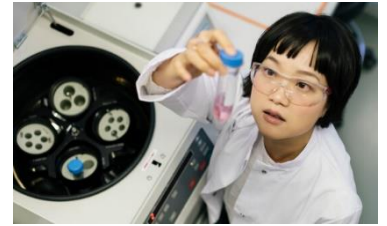
Accelerate your business