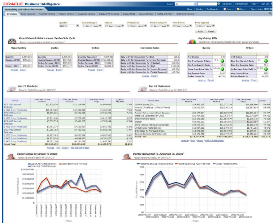
Figure 1. Oracle Price Analytics provides rich performance data that drives better pricing decisions and, in turn, improves an organization's profitability.