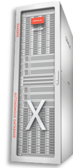
Oracle Exadata Database Machine X10M

The Oracle Exadata Database Machine (Exadata) is engineered to deliver dramatically better performance, cost-effectiveness, and availability for Oracle databases. Exadata features a modern cloud-enabled architecture with scale-out high-performance database servers, scale-out intelligent storage servers with state-of-the-art PCIe flash, unique storage caching using RDMA accessible memory, and cloud-scale RDMA over Converged Ethernet (RoCE) internal fabric that connects all servers and storage. Unique algorithms and protocols in Exadata implement database intelligence in storage, compute, and networking to deliver higher performance and capacity at lower costs than other database platforms. Exadata is ideal for all types of modern database workloads, including Online Transaction Processing (OLTP), Data Warehousing (DW), In-Memory Analytics, Internet of Things (IoT), financial services, gaming, and compliance data management, as well as efficient consolidation of mixed database workloads.