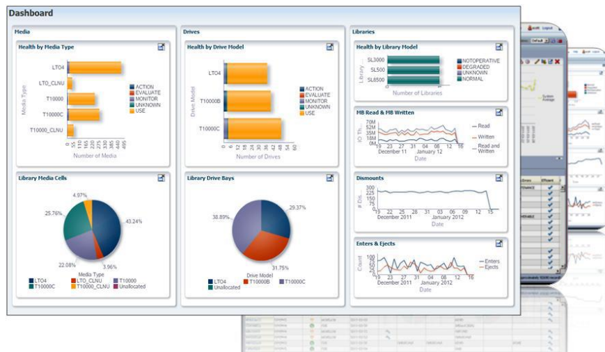
Figure 2. Oracle's StorageTek Tape Analytics software simplifies tape storage management because it takes a proactive approach to eliminate library, drive, and media errors.

For intelligent monitoring of StorageTek tape libraries, StorageTek Tape Analytics software provides tape storage customers with access to leading-edge tape monitoring software that goes far beyond exposing a red, yellow, or green indicator. Rather, StorageTek Tape Analytics software provides insights into hundreds of drive, media, and library health attributes that empower tape storage administrators to make proactive decisions about their tape environments prior to device failures. A proactive approach to managing the health of a tape environment improves the performance and reliability of existing tape investments and helps executives make informed decisions about future expenditures.