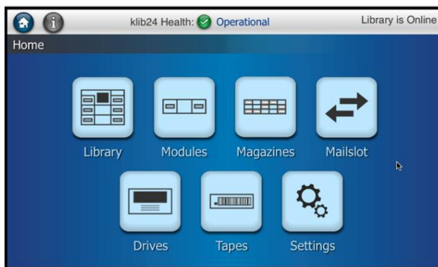
Figure 1. StorageTek SL150 modular tape library touchscreen operator panel

With the StorageTek SL150, simplicity begins with the library installation and continues throughout the life of the product, even as you expand for data growth. The library can initialize in a few steps via the local touchscreen operator panel, and upgrades are easy because they require no tools, complicated cabling, or technical support.