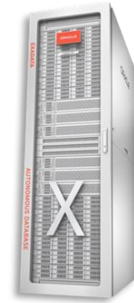
Oracle Exadata Database Machine X10M

The Oracle Exadata Database Machine (Exadata) is engineered to deliver dramatically better performance, cost-effectiveness, and availability for Oracle databases. Exadata features a modern cloud-enabled architecture with scale-out high-performance database servers, scale-out intelligent storage servers with state-of-the-art PCIe flash, unique storage caching using RDMA accessible memory, and cloud-scale RDMA over Converged Ethernet (RoCE) internal fabric that connects all servers and storage. Unique algorithms and protocols in Exadata implement database intelligence in storage, compute, and networking to deliver higher performance and capacity at lower costs than other database platforms. Exadata is ideal for all types of modern database workloads, including Online Transaction Processing (OLTP), Data Warehousing (DW), In-Memory Analytics, Internet of Things (IoT), financial services, gaming, and compliance data management, as well as efficient consolidation of mixed database workloads.