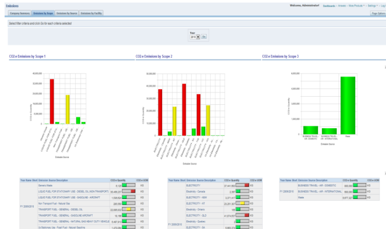
Figure 1. Pre-built business analytics dashboards providing data driven insight and identifying issues and opportunities.

Oracle Environmental Accounting and Reporting enables organizations to establish a baseline of its greenhouse gas emissions, energy usage, and other key environmental indicators and set reductions targets. Graphical indicators illustrate to users on a timely basis whether the organization is performing above, below, or in-line with the targets so that corrective actions can be taken as needed to successfully execute on sustainability initiatives. The data also serves as the basis for forecasting and planning.